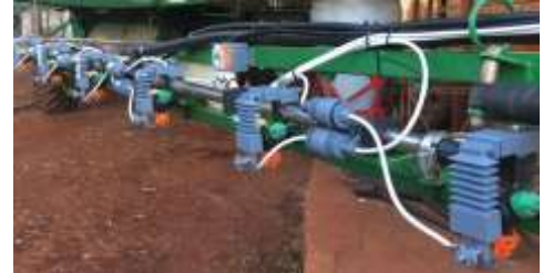
SPE kit for boom sprayer