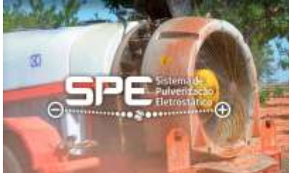
SPE kit for atomizer